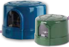
ZTL124F (FAIL OFF)