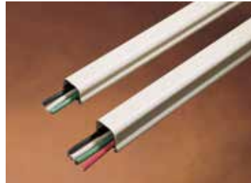
500 Series Raceway and components used in a ceiling fan installation.