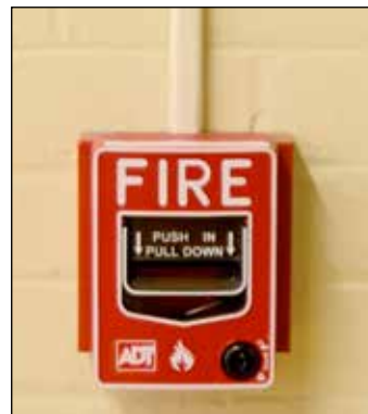
Typical applications for 500 & 700 Series Raceway.