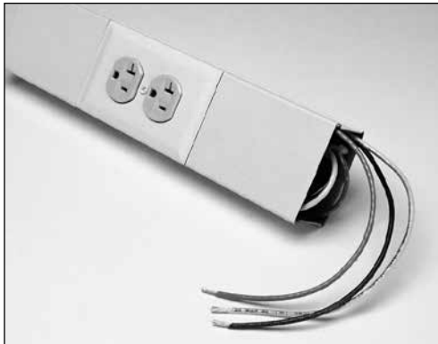
3000 Series Raceway shown electrically prewired.

Two options available when ordering a prewired job: