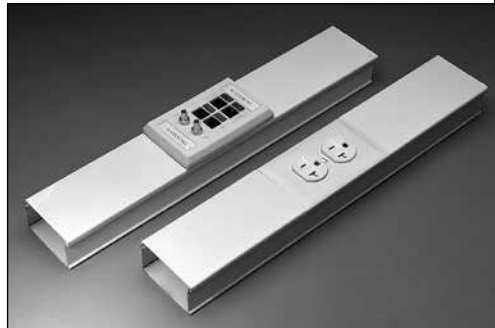
3000 Series Raceway shown utilizing data inserts and electrical devices.

3000 Series Raceway is ideally suited for wiring applications in frequently changing environments such as labs, hospitals and other industrial applications.