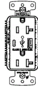
20A STANDARD GRADE DEVICE