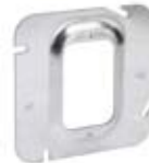
TP574-TP582, TP529, TP531