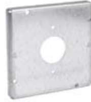
TP724, TP730, TP736