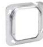
TP584, TP586, TP589, TP593, TP541, TP543