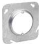
TP569, TP570, TP571 TP573, TP575