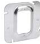
TP574-TP582, TP529, TP531