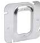
TP574-TP582, TP529, TP531