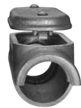
Crouse-Hinds Form 7 (C57, 1-1/2") 26 Cubic Inches Capacity