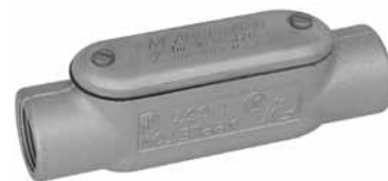
Conduit Body with Cast Aluminum Cover, 1" Type C shown