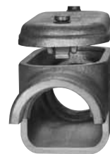
Appleton FM7 (C57, 1-1/2") 28 Cubic Inches Capacity Flat-Back Design

Illustrated views are cut away to demonstrate back configurations.