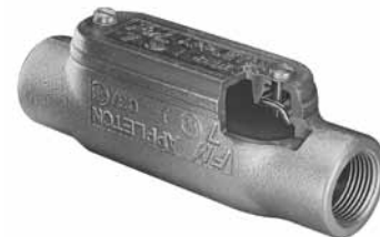
Grayloy™-Iron, 1" Type C shown with cut-away body and cover to illustrate Wedge-Lok™ Clip Cover detail

Illustrated views are cut away to demonstrate back configurations.