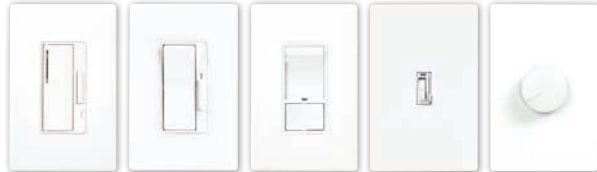
AAL06 DAL06P SAL06P TAL06P1 RI061