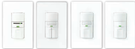
OS106D1 OS310R OS310U OS306U