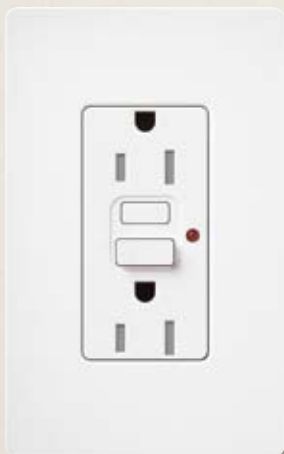
Tamper resistant GFCI receptacle