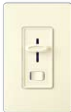
LA Light Almond