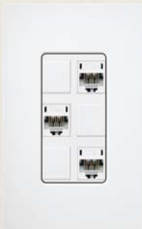
Customizable 6-port frame