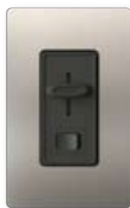
SS Stainless Steel

*Coordinating wallplates only available separately. For wallplate information, see pg. 160.