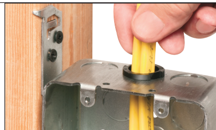
2 Insert cable(s) into individual openings.