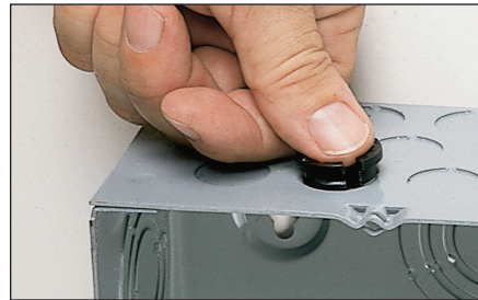
1 Push the NM cable connector into the knockout with light finger pressure.