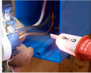
Built-in worklight (NCV-1030, NCV-1040)