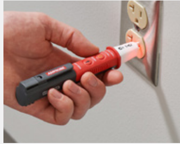
Test wall sockets for AC voltage