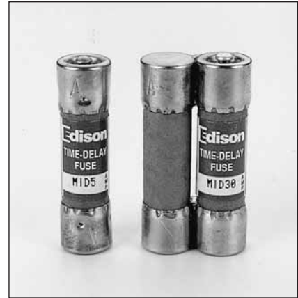
Catalog No. MID (0.1 - 30A) 0.1 - 0.8A 250Vac or Less 1 - 15A 125Vac or Less 20 - 30A 32Vac or Less Pin Indicating - Time-Delay