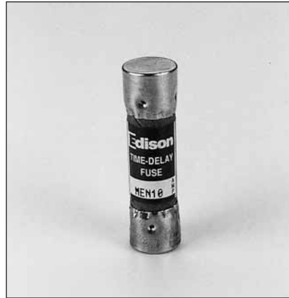
Catalog No. MEN (0.1 - 30A) 250Vac or Less Time-Delay

Recommended Fuse Blocks: Page 151. Recommended Inline Fuse Holders: Page 147. Recommended Panel Mount Holders: Page 150.