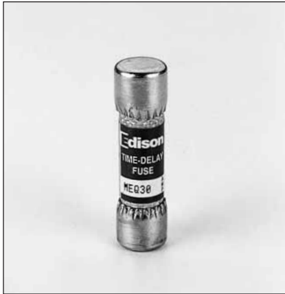
Catalog No. MEQ (0.1 - 30A) 500Vac or Less Time-Delay