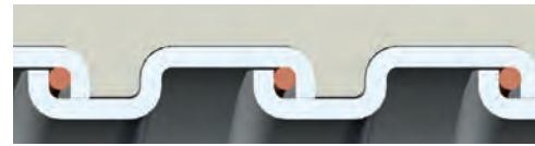
Square-Locked Design with integral bonding wire 3/8" through 1-1/4"