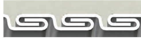
Interlocked Design 1-1/2" through 4" with no bonding wire