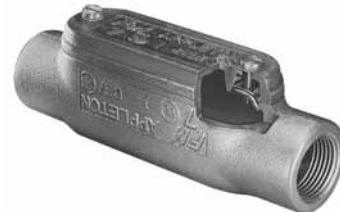
Grayloy™-Iron, 1" Type C shown with cut-away body and cover to illustrate Wedge-Lok™ Clip Cover detail

Illustrated views are cut away to demonstrate back configurations.