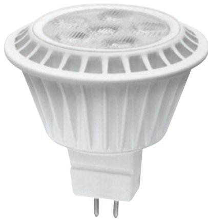
7W 12V MR16