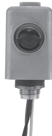
K4136M, K4421M, K4423M