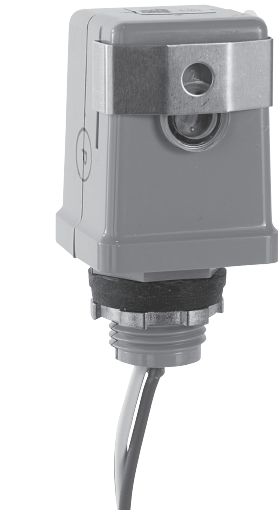
K4121C, K4123C, K4127, K4135, K4141C