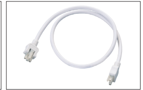
HU103 24" Daisy Chain Connector