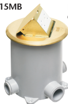
FLBT6615MB open on FLBC4500 concrete box