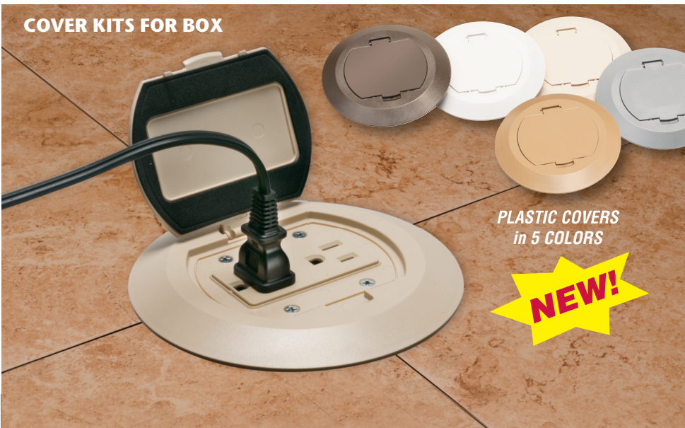
Box without mud cover