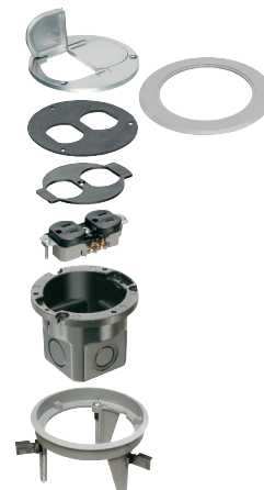
FLB4360NL nickel-plated brass cover