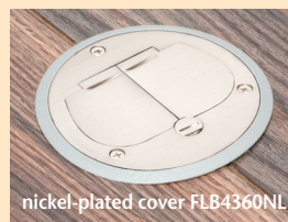
nickel-plated cover FLB4360NL