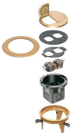
FLB4360MB brass cover

Metal or Non-metallic Covers • FASTEST Installation in Existing Floor