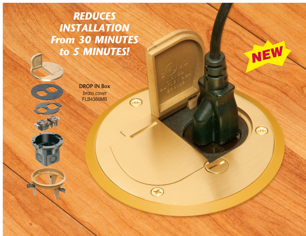
DROP IN Box brass cover FLB4360MB

FIVE MINUTE installation with SINGLE Hole Saw • Low Profile Covers