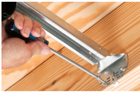
Bracket mounts securely to joists.