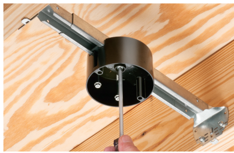
Loosen center screw to position box on bracket.