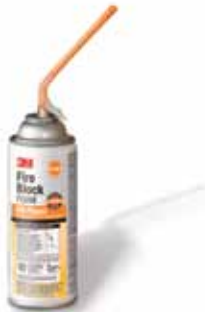
Easy-to-install fireblock and draftstop for Type V Residential and other non-rated construction.