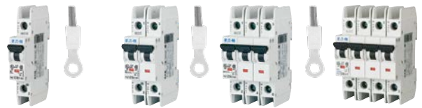
FAZ-RT UL 489 circuit breakers with ring-tongue terminals at 480/277 Vac—10 kAIC, 14 kAIC D curve (13–20 A)