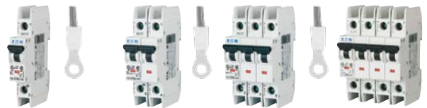
FAZ-RT UL 489 circuit breakers with ring-tongue terminals at 480/277 Vac—10 kAIC, 14 kAIC D curve (13–20 A)