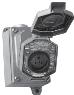
ENR Receptacle see page 1350

Portable GFCI Cable Assemblies mate with a variety of our industry-leading receptacle solutions: