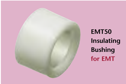
EMT50 Insulating Bushing for EMT