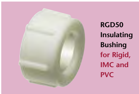
RGD50 Insulating Bushing for Rigid, IMC and PVC