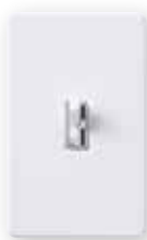
Ariadni® C•L™ Gloss colors (excluding gray)