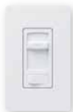
Skylark Contour™ C•L™ Gloss colors