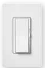
Diva® C•L™ Gloss and Satin Colors®