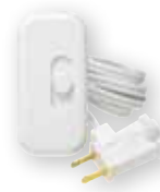
Credenza® C•L™ Black (BL), White (WH), and Brown (BR)