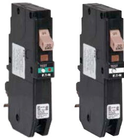
Plug-on neutral breakers