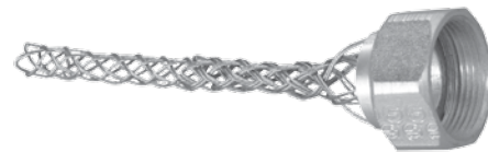
Wire Mesh Strain Relief for Cord Connectors