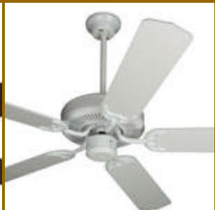
CD52W BCD-5W White finish with White blades.