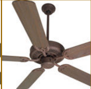
CD52BS BCD5-WWB Brownstone™ with Washed Walnut Birch blades. (Brownstone™ is a registered trademark of Dolan Designs.)