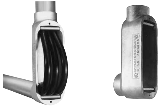
2" Type LB with rollers shown