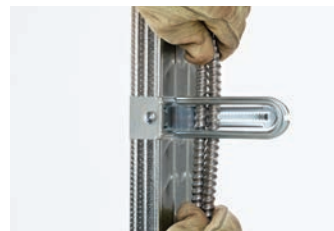
Insert Cables to be secured