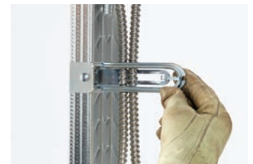
Once cables are inserted, wrap zip-tie around the end of the support to secure the cables