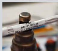
PermaSleeve® Wire Marking