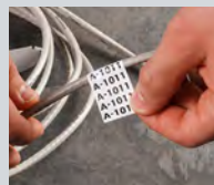
Voice & Data Communications