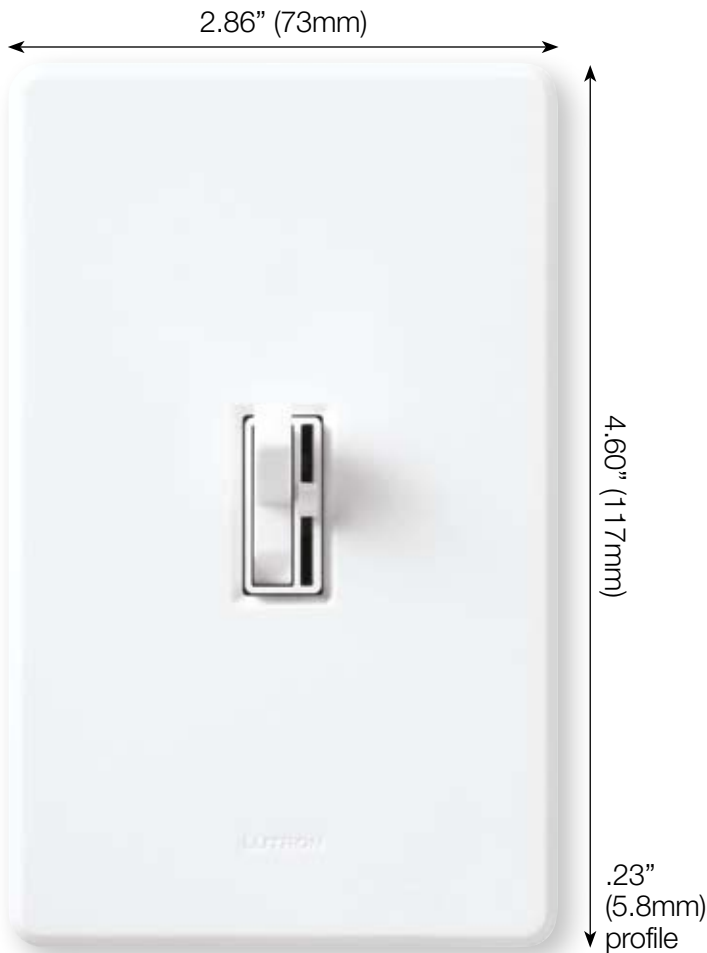
Shown actual size: Ariadni® preset dimmer and 1-gang Fassada® wallplate in white (WH)