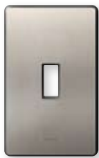
SS Stainless Steel*

*Stainless Steel finish wallplates include black plastic trim/adaptor, visible from side. Match with separate Black (BL) controls.