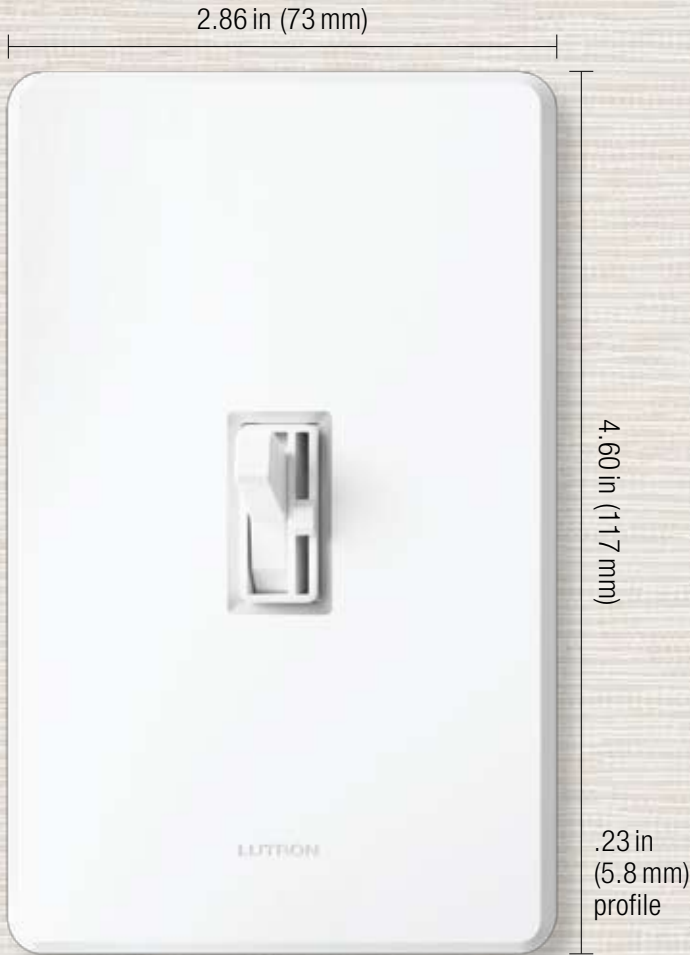
Shown actual size: Ariadni dimmer and 1-gang Fassada wallplate in White (WH).