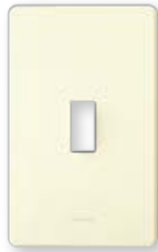
LA Light Almond