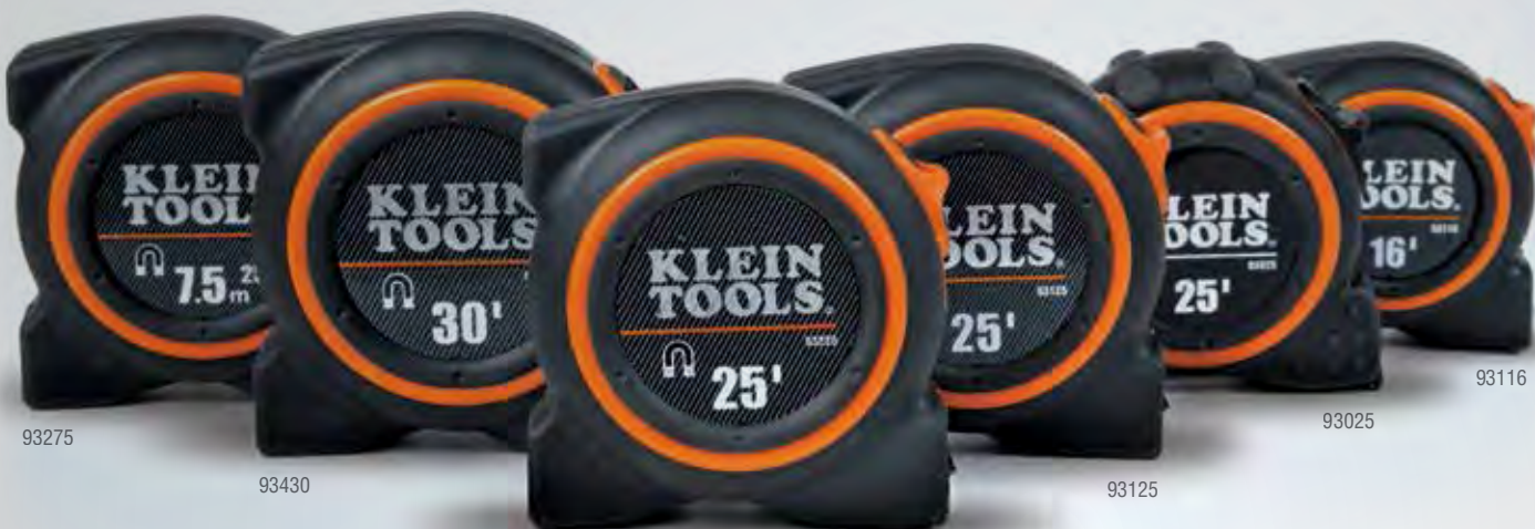
RARE EARTH MAGNETS