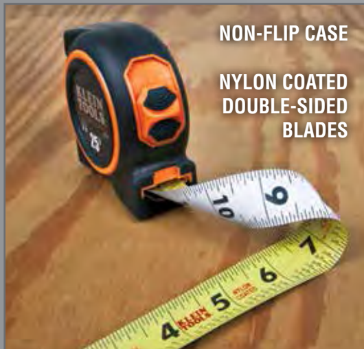
NON-FLIP CASE NYLON COATED DOUBLE-SIDED BLADES