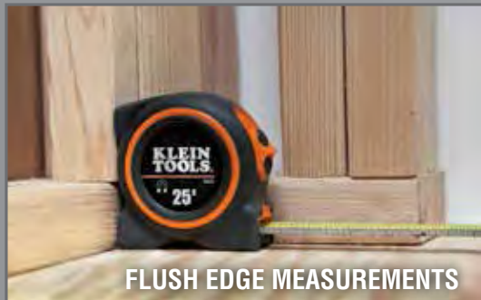
FLUSH EDGE MEASUREMENTS

For over 155 years, Klein Tools has set the standard that others measure up to! This new line of Tape Measures extends the Klein legacy of combining innovative features with Klein's quality, durability and comfort. With a Klein in your hand, you can be sure of quick, easy and accurate measurements, and a tape that will stand up to the measuring tasks at any job site.