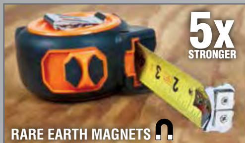
5x STRONGER RARE EARTH MAGNETS