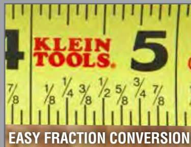
EASY FRACTION CONVERSION