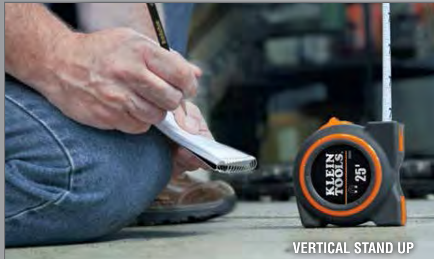
VERTICAL STAND UP