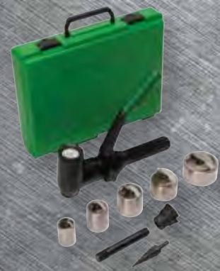
SPEED PUNCH™ KIT (w/Quick Draw 90 Driver)