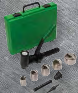
SPEED PUNCH™ KIT (w/Quick Draw 90 Driver)