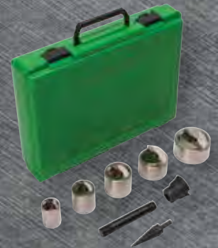
SPEED PUNCH™ KIT (without driver)*

Look for SPEED PUNCH™ products and "Try Me" display at supporting Greenlee distributors.