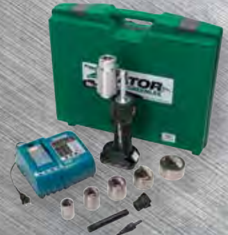
SPEED PUNCH™ KIT (w/LS50 Driver)

* Case accommodates Quick Draw or Quick Draw 90 Drivers - sold separately.