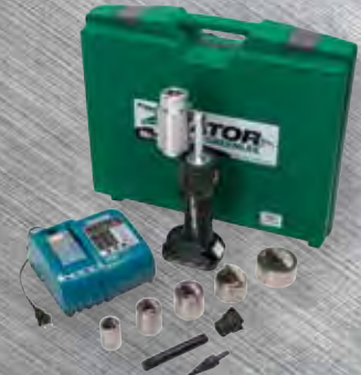
SPEED PUNCH™ KIT (w/LS50 Driver)

* Case accommodates Quick Draw or Quick Draw 90 Drivers - sold separately.