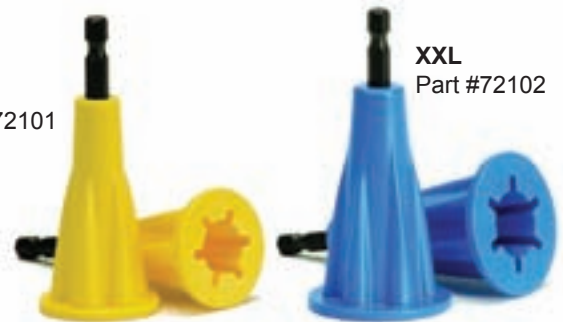
XXL Part #72102