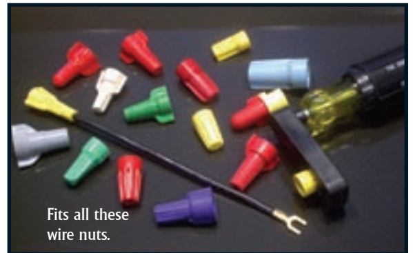
Fits all these wire nuts.

Do you prefer to twist your nuts or spin your nuts? Twisting is slow and can be painful, especially when carpal tunnel sets in. Why not spin your wire nuts with the NUT SPINNER? Much faster and easier, and it really cinches them up.