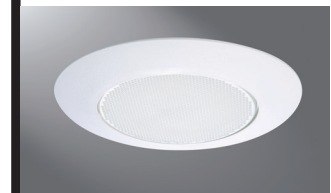
70PS Albalite Glass Lens, White Polymer Trim, White Trim