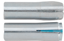
SMART DI+™ DROP-IN