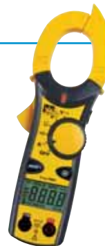
▶ 61-746 features: