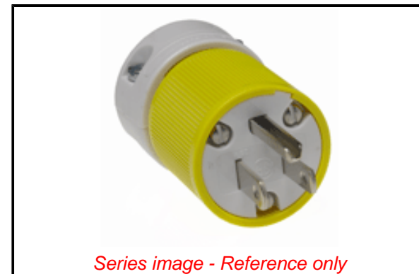
Series image - Reference only