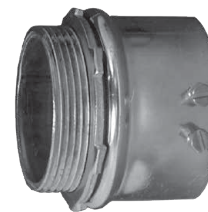
4125S - 4400S