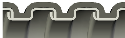
Square-Locked Design 3/8" through 2"