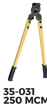
35-031 250 MCM