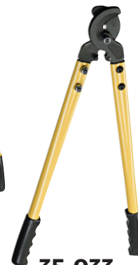
35-033 1000 MCM