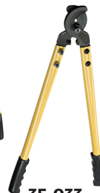
35-033 1000 MCM