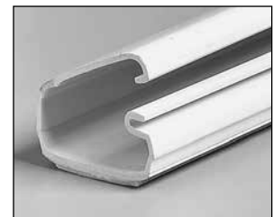
Uniduct® 2900 Series Raceway