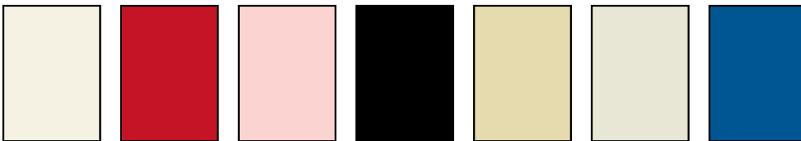
Primer Red Pink Flat Black Ivory Light Almond Blue

To order custom metal wall plates, see Pages P-40 – P-44.