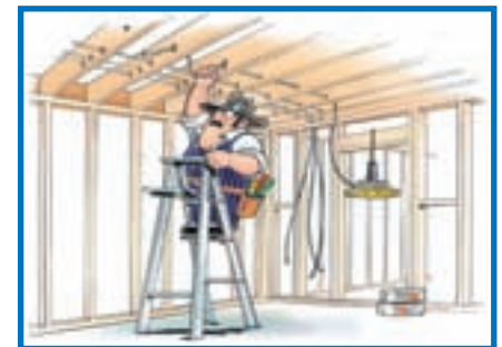
A New Way