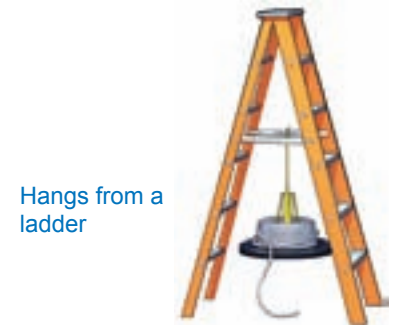
Hangs from a ladder