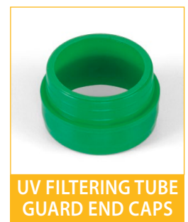
UV FILTERING TUBE GUARD END CAPS

Note: End Caps for T5, T8 and T12 Tube Guards fit inside the Tube Guard.