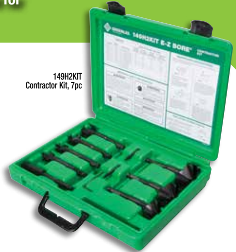
149H2KIT Contractor Kit, 7pc

Dual cutting edges can be re-sharpened for longer bit life.