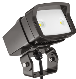
YK- Yoke mount