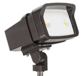
Vandal Guard (Polycarbonate lens) OFL1VG