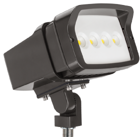
THK- Knuckle with 1/2" NPS threaded pipe